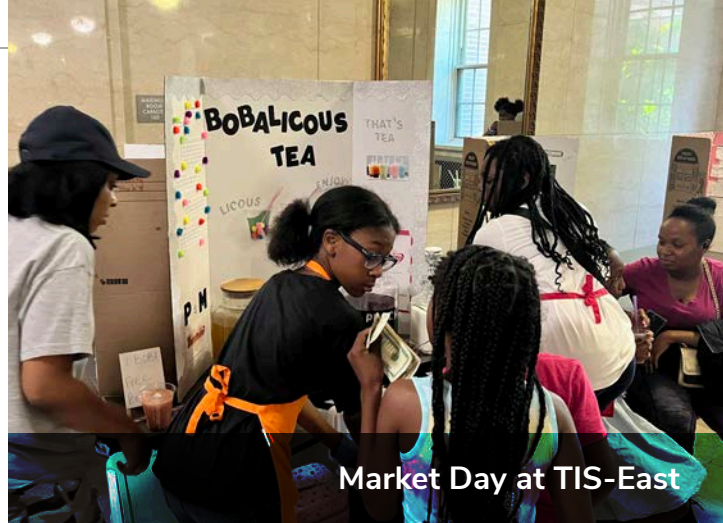
Market Day at TIS-East

understanding customer engagement. These essential skills empowered students to connect classroom concepts to meaningful, hands-on experiences they will carry well beyond the classroom.